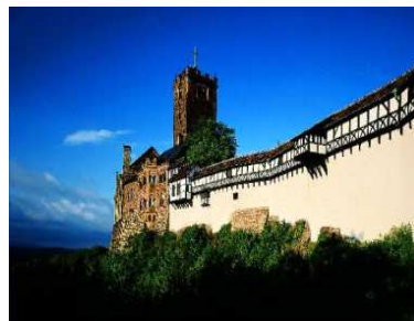
The Wartburg, Eisenach