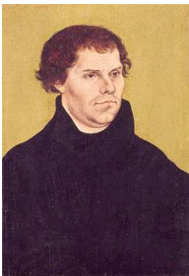
Luther, by Lucas Cranach the Elder