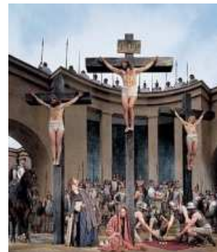
Oberammergau Passion Play, Bavaria